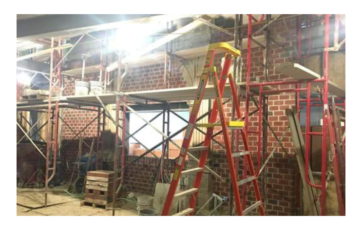
Interior Stone Veneer Installation Area F Vestibule