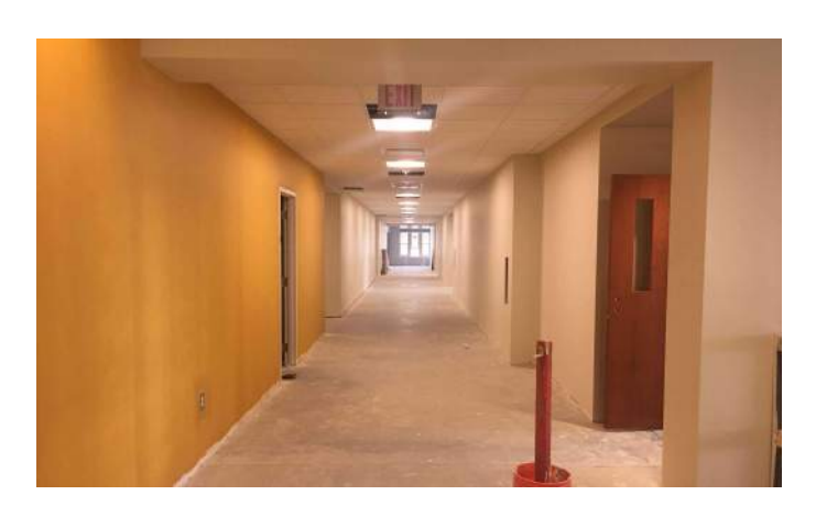
Painting Accent Walls Area A 3rd Floor