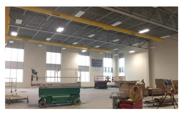
Painting Structural Steel Area C Washington Level