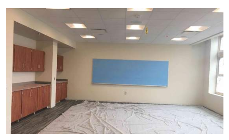
Classroom Finishes Area A 2nd Floor