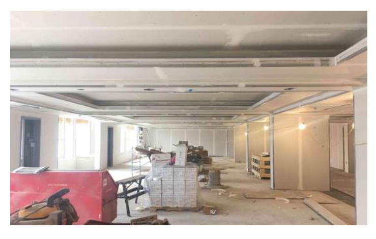
Coffered Ceiling Drywall Finishing Area G 2nd Floor